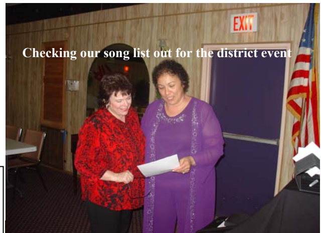
Checking our song list out for the district event