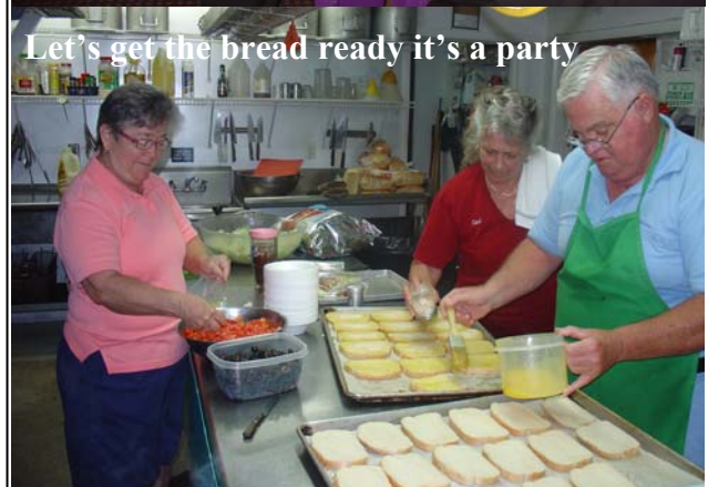
Let's get the bread ready it's a party