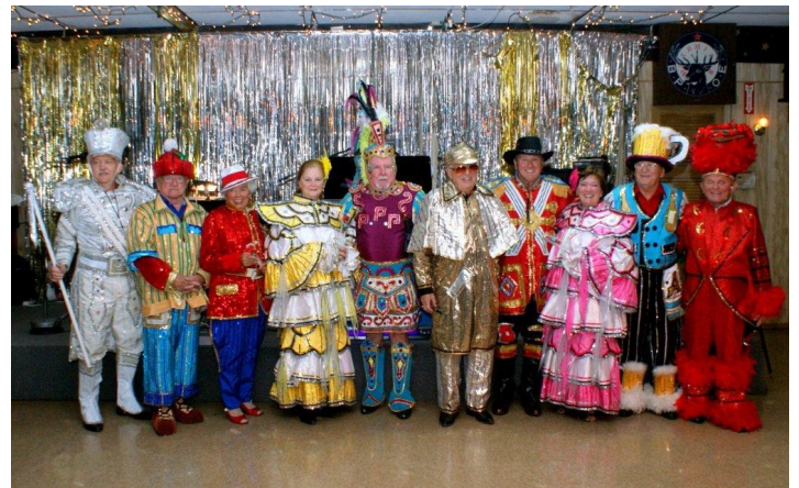
Smokey's Bomba Mummies

CREDIT CARD MACHINES Now Available in the Lodge