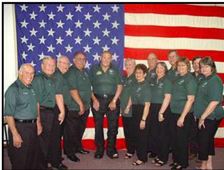
Not pictured: Sandy Mooney