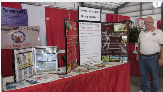
Manatee County Fair