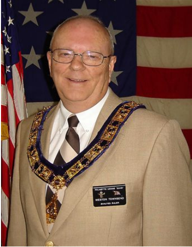
Dear Lodge Members

4611 4th Avenue E. ▪ P.O. Box 272 ▪ Palmetto, FL 34220-0272 ▪ PH. (941) 722-6937 ▪ Fax (941) 722-6246 June/July 2009 No 6/7