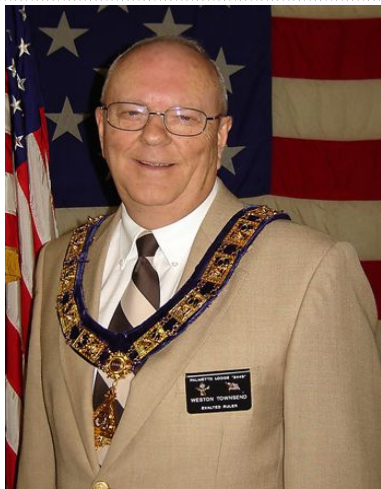
Dear Lodge Members

4611 4th Avenue E. ▪ P.O. Box 272 ▪ Palmetto, FL 34220-0272 ▪ PH. (941) 722-6937 ▪ Fax (941) 722-6246 January 2010 No 1